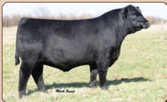
S A V CAST IRON 8083 BORN 2/25/08 AAA 16115619 TATTOO #8083 Owned by: Schaff Angus Valley, ND; Buford Ranches LLC, OK; Limestone LLC, OK; Dameron Angus, IL; Blue-Ston Farms, IL