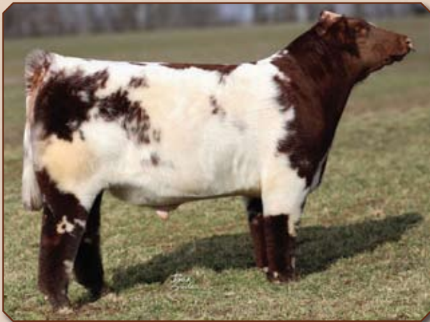
Owned by: Guyer Cattle Company; Lawrence Cattle Co.; Waldock Bros. BORN 1/10/05