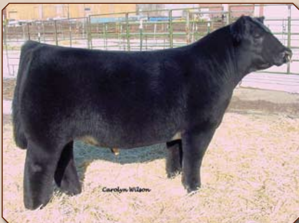
Owned by: Trausch Farms; Bobby Wellner BORN 4/10/07