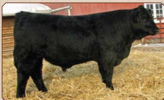
HOOKS WINDSOR 55W BORN 3/4/09 ASA 2514395 Owned by: Hook Farms Inc., MN; ABS Global, Inc., WI