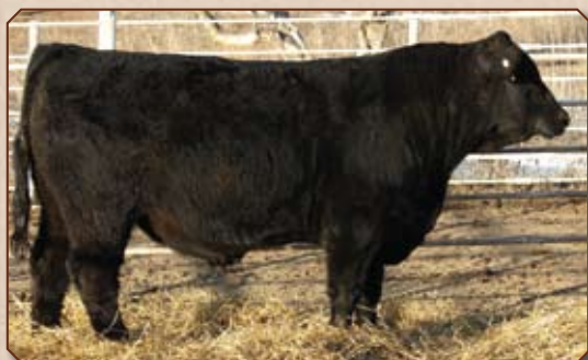
TJ 181W HY SLUGGER BORN 1/28/09 ASA 9656760 Owned by: Gibbs Farms, AL; Triangle J Simmentals, NE