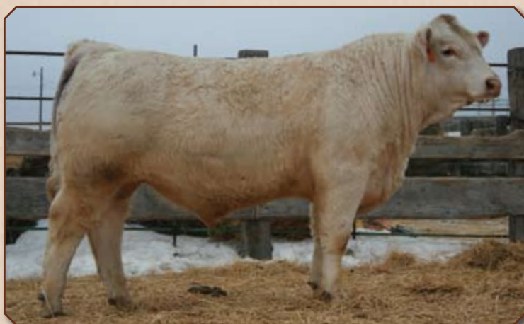
DCR SOLUTION W13 BORN 2/2/09