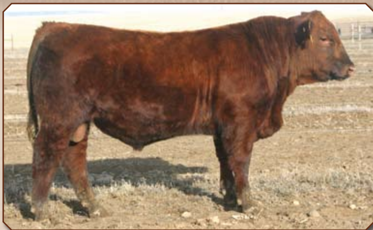
PZC FULLY INSURED 901 ET BORN 3/4/09