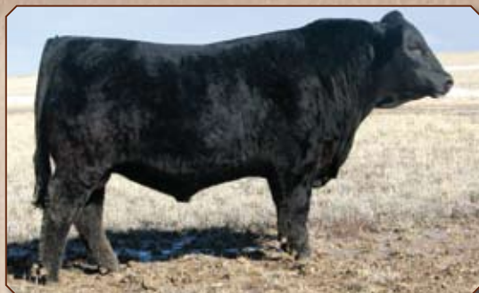
TNT FINAL CHOICE W210 BORN 2/25/09 ASA 9669072 Owned by: TNT Simmentals Ranch, ND; NLC Simmentals, SD; ABS Global, Inc., WI