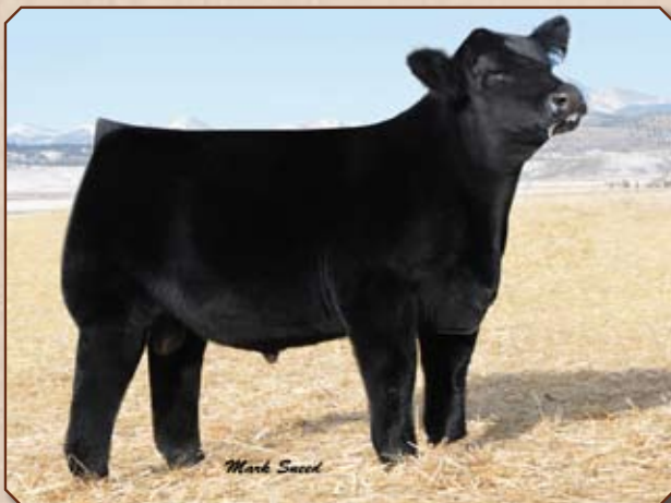
Owned by: Don Putz; Derick Putz BORN 3/12/09