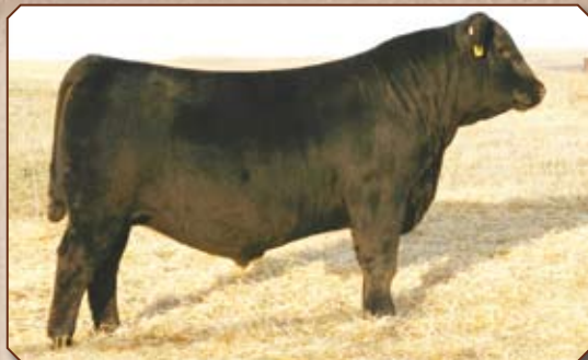
S A V BRUISER 9164 BORN 3/5/09 AAA 16396531 TATTOO #9164 Owned by: Schaff Angus Valley, ND; Quaker Hill Farm LLC, VA Woodhill Farms, Inc., WI; ABS Global, Inc., WI